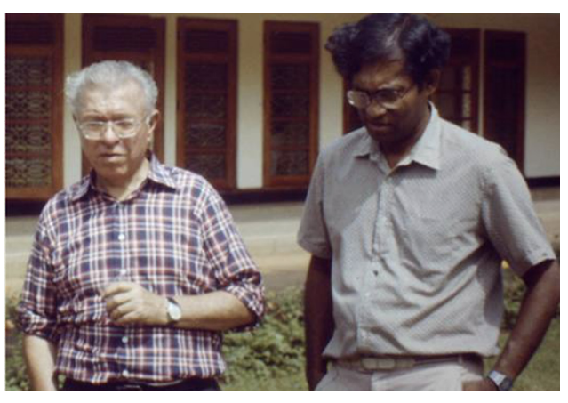
Fig.4 Fred Hoyle and Chandra Wickramasinghe, in Sri Lanka, 1982.

Unfortunately, a great deal does, however, rest on the acceptance or otherwise of theories relating to life in the Universe. It is likely that our very survival may depend on facing facts and conceding the long-overdue paradigm shift from the idea of the spontaneous generation of life on Earth to life as a cosmic phenomenon and cometary panspermia, as proposed by the present writer and Fred Hoyle nearly four decades ago.